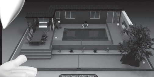
Launch Pool and Patio Game