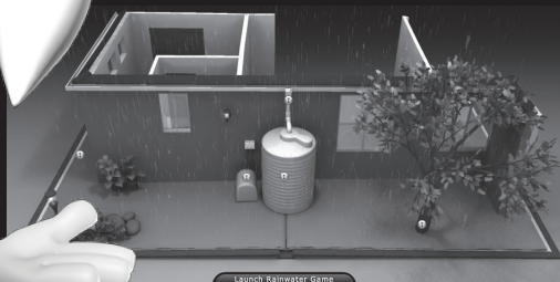
Launch Rainwater Game